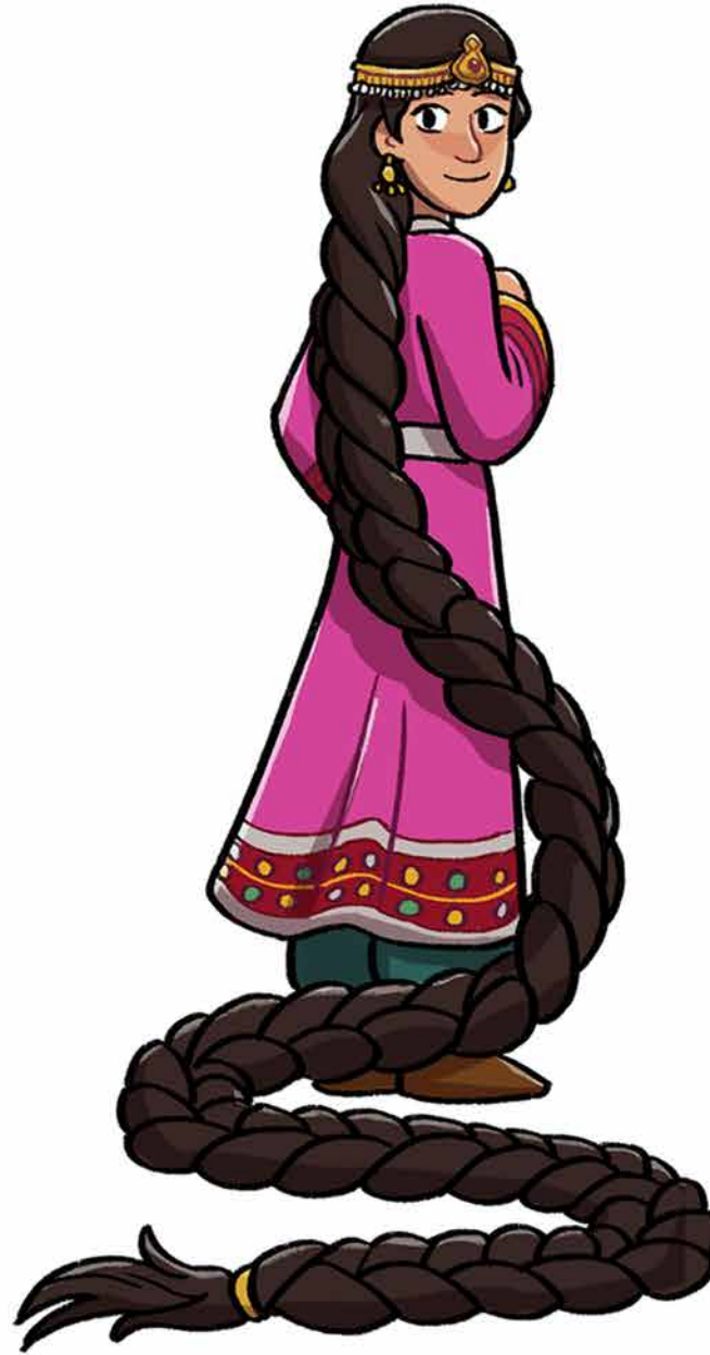
RUDABEH: Princess of Kabul